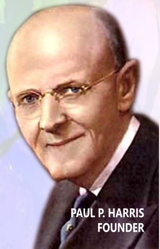
PAUL P. HARRIS FOUNDER